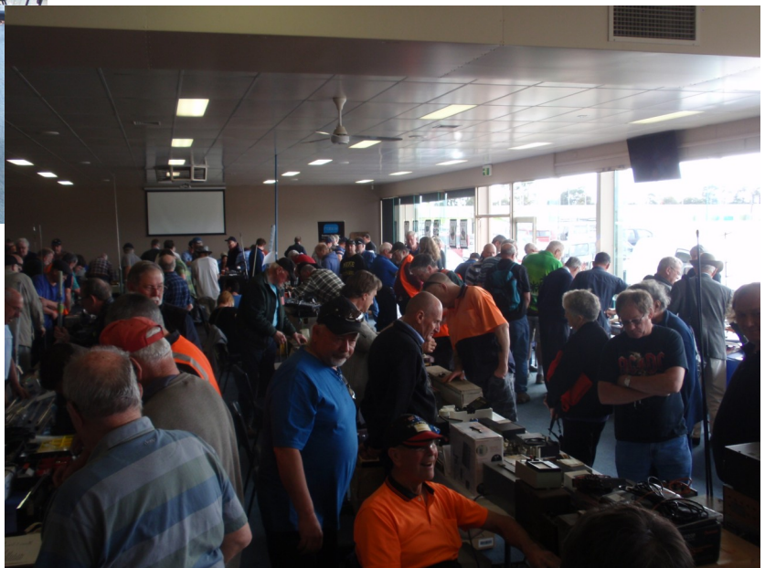
Showing the crowd during the day