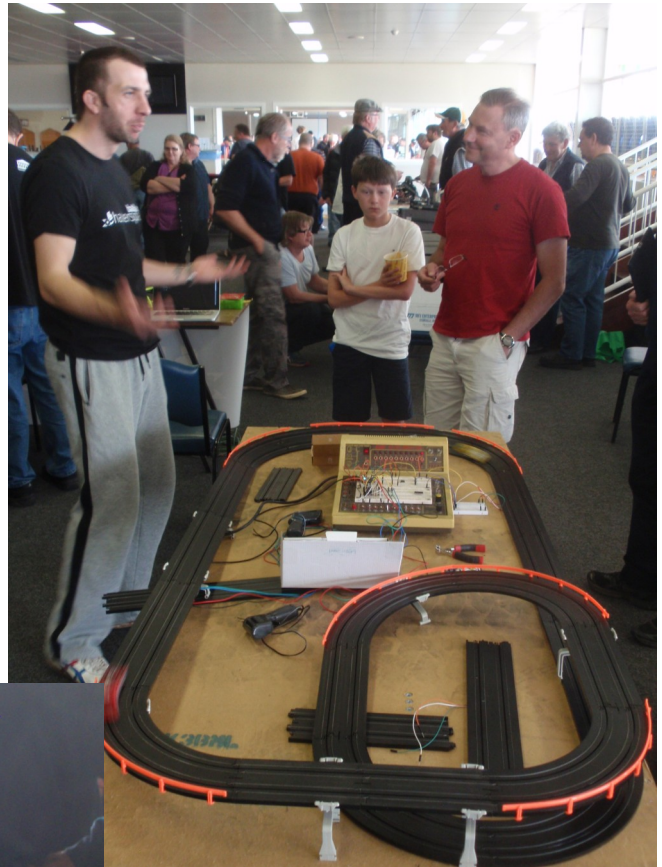
Hackspace set up which was fun