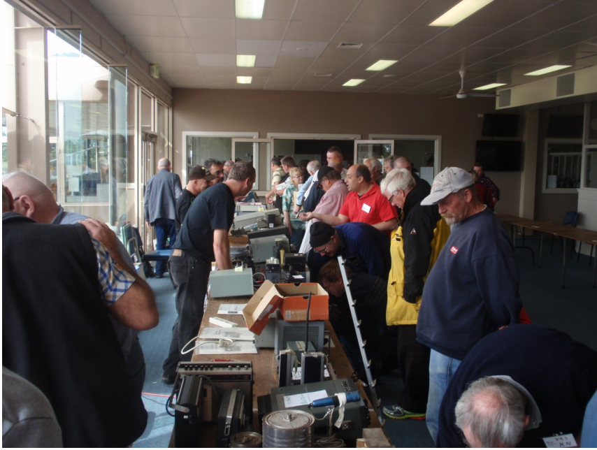
During the day at some stage