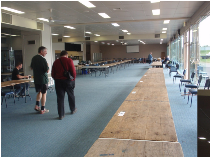
Just after setup before coffee time