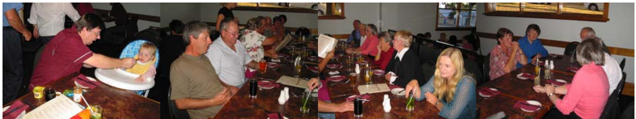
Some of our members enjoying our monthly dinner. This month was at the Brown Hill Hotel.