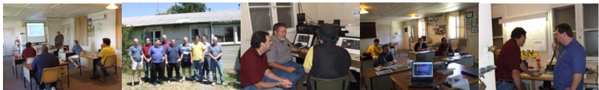
Some shots from our first Foundation exam day.