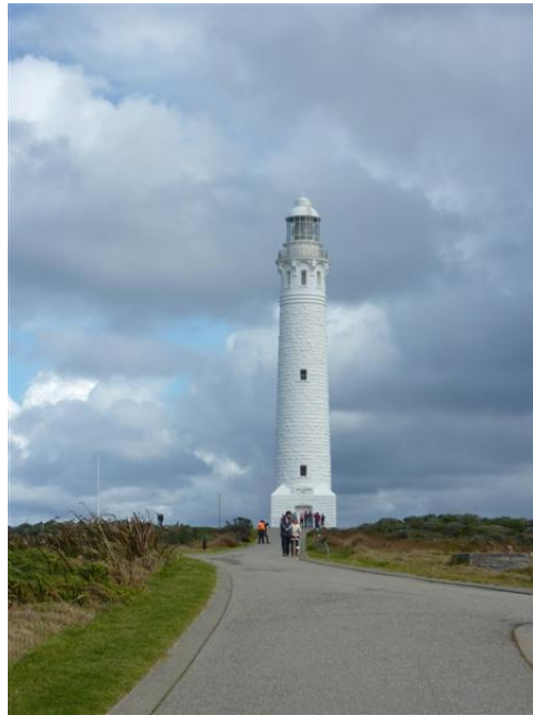
Cape Leeuwin Lighthouse