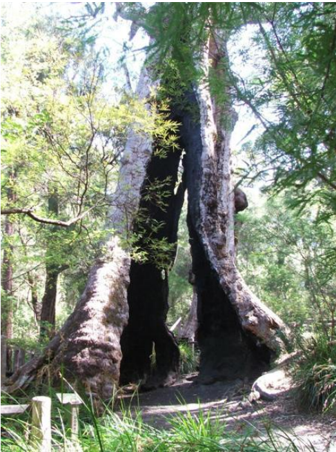
Some ancient burned out trees in Pemberton