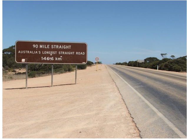
Longest straight road 146.6 km