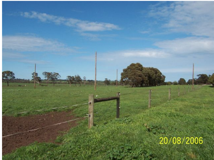
The antenna set up in the paddock next to the house