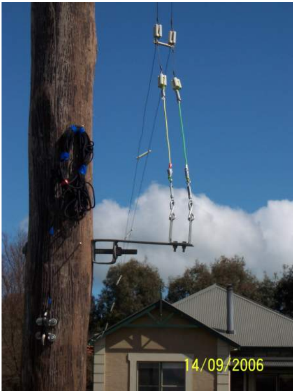
Up path way we set up the feed line to the house.